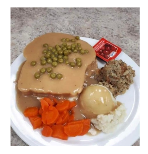
NEW! <u>Kids Menu*</u> (12 and Under ONLY)

Hot Turkey Sandwich (Half) $8.99 (Full) $11.25